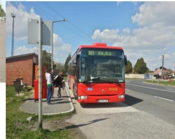
HU-SK: Pozsony (Bratislava) - Rajka