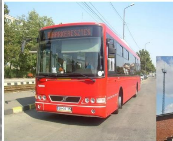
HU-RO: Biharkeresztes-Nagyvárad (Oradea)